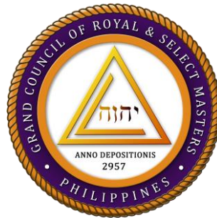
GRAND COUNCIL OF ROYAL & SELECT MASTER OF THE PHILIPPINES