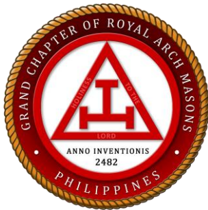
GRAND CHAPTER OF ROYAL ARCH MASONS OF THE PHILIPPINES