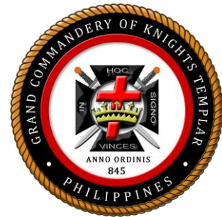
GRAND COMMANDERY OF KNIGHTS TEMPLAR OF THE PHILIPPINES